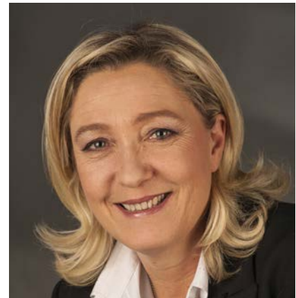
Marine Le Pen